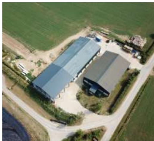
Aerial Photo August 2020